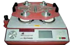
Test unit for abrasion resistance and pilling formation

The resistance of a furniture material against abrasion (i.e., to wear) is designated as abrasion resistance. This criterion therefore give information on how break-resistant a fibrous fabric is. Tests are generally conducted with the Martindale method. This technique circularly abrades one material against another. The abrasion lasts as long as at least two threads are broken. The optical impression is not used here. If furniture material is used in an office, a Martindale value of 40,000(or more) abrasion cycles is recommended.