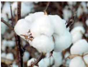
The burst cotton boll with protruding seed fibres.

Cotton yarn is manufactured from the long seed fibres of the cotton boll.